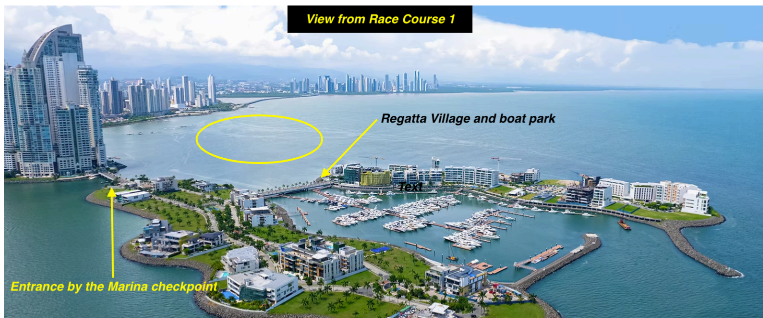
Aerial view of Race course 1 and regatta venue